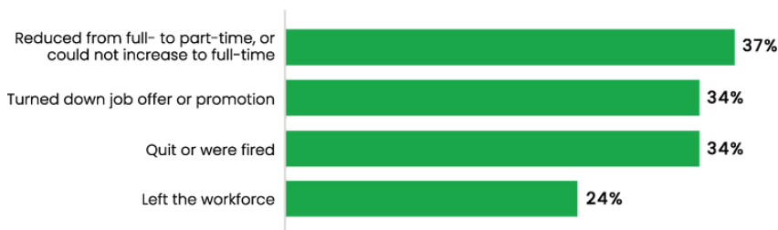
Prevalence of employment challenges due to childcare experienced by working parents Shelby County, First half of 2022

The most significant obstacles to securing childcare cited by working parents in Shelby County are ACCESS, AFFORDABILITY, & QUALITY